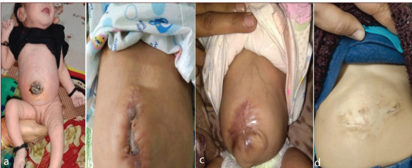
[Table/Fig-3]: Follow-up pictures of different patients at: a) one month; b) six months; c) One year; d) Three years.